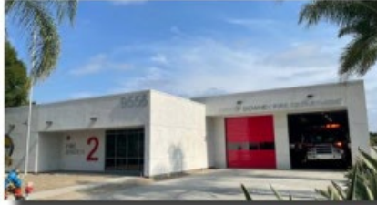
Fire Station No. 2