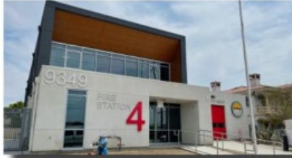
Fire Station No. 4

Four Fire Station Improvement Projects $22.7 M - Station modernization through completion of Improvement to the interior spaces of the station, and reconstruction of pavement. Fire Stations 1 and 3 were completed in FY 2020-21. Fire Stations 2 and 4 were completed in FY 2021-22.