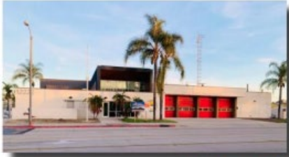
Fire Station No. 1