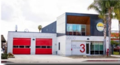
Fire Station No. 3